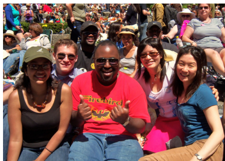
Fellow SFTMers & friends enjoying Brazilian & Cuban music