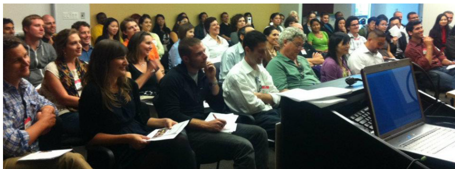
Golden Gate Toastmasters and San Francisco Toastmasters joined forces on September 21